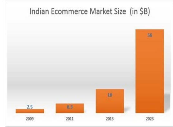
Fig 3: E-Commerce market growth in India [13]

Let us now study the key market and technology trends in e-commerce which indirectly will lead to the increasing growth of e-commerce in India: